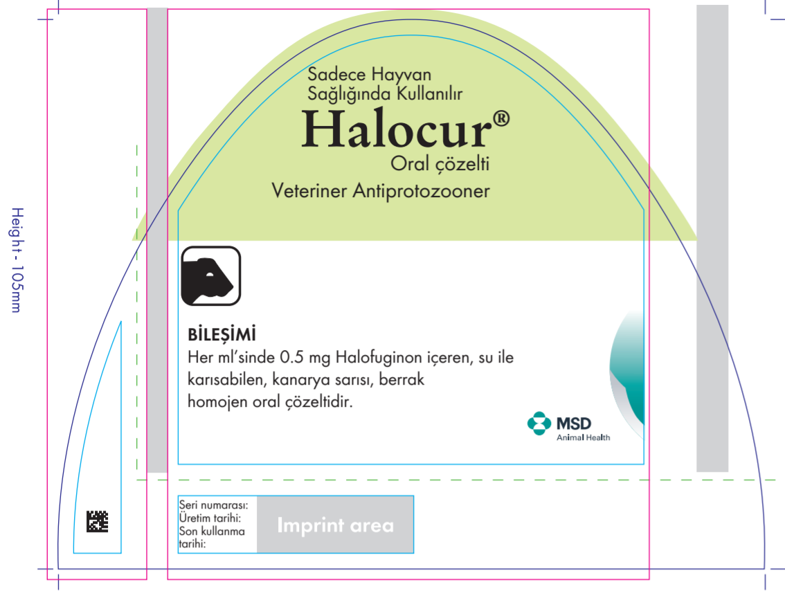
Base Label - 135mm